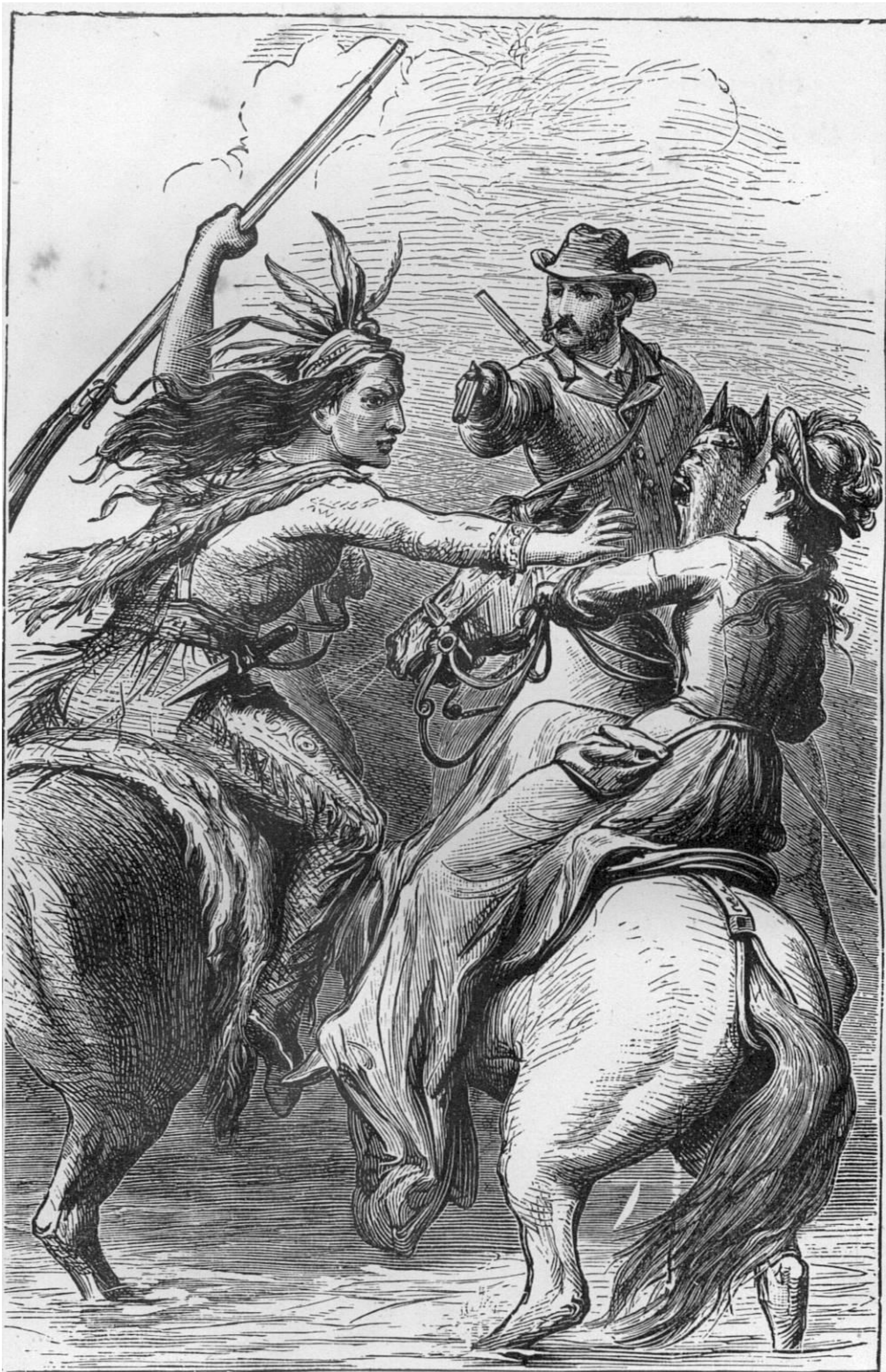
LORRAINE, DASHING FORWARD AND LEVELLING A PISTOL, SHOT HIM IN THE ARM.